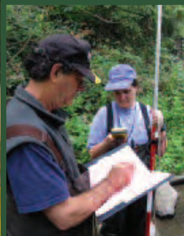
COLLECTING CREEK DATA