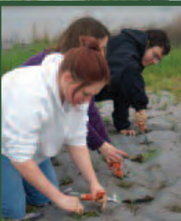
PLANTING NATIVE GRASSES