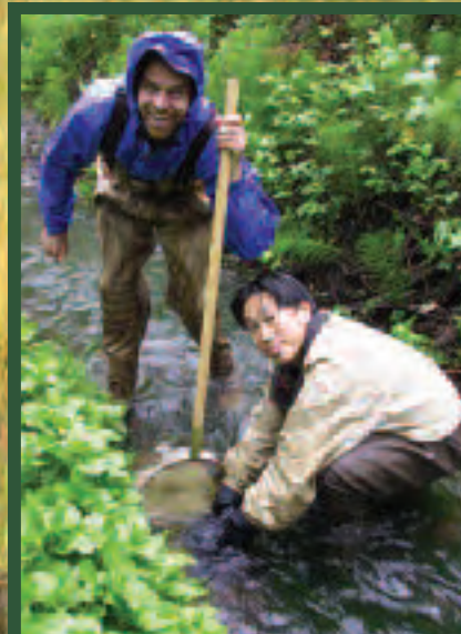
COLLECTING AQUATIC LIFE

Throughout Contra Costa County creek and watershed stewardship groups work to protect our creeks and open spaces from non-native plant and animal species, toxic chemicals, and other impacts such as illegal dumping and soil erosion. Volunteers of all ages, working with experts, remove invasive plants and replace them with native species to create healthy habitat for our wildlife and to stabilize creek banks. They also collect and analyze water quality data and conduct litter and debris clean-up projects.